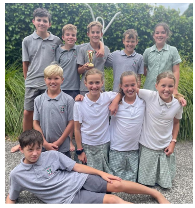
Well done to our Year 7/8 Mixed Touch team, CSR Electrical Shaq, Runners Up for Term 1 2024. Go Shaq!